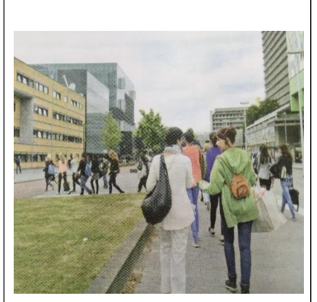
Fig. 7 Choosing where to go for higher edu. (FLE, p. 34)