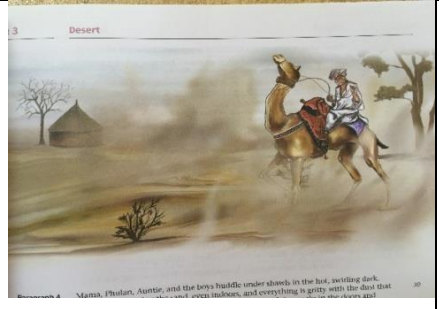
Fig. 3 Storm in the Desert (OPE, p. 35)