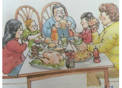
Fig. 6 Fat Man Walking (OPE, p. 61)