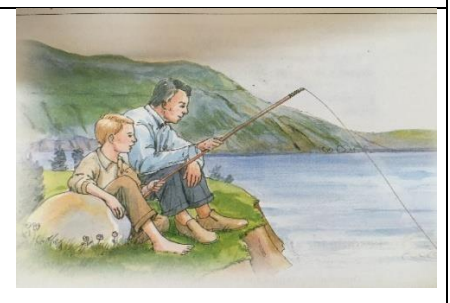
Fig. 4 The kingdom (OPE, p.130)