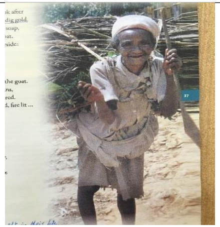
Fig. 8 Why the old woman limps (FLE, p. 37)