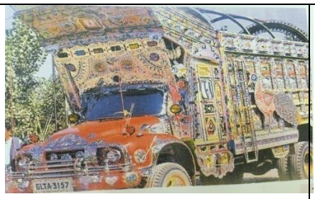
Fig. 1 Kaleidoscopes on wheels (OPE, p. 20)