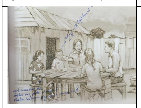
Fig. 5 A Beijing Childhood (OPE, p. 57)